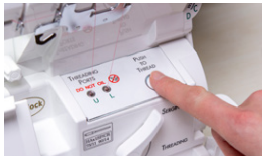
ExtraordinAir® Threading With just a burst of air, the looper threads are instantly passed through both loopers. Threading has never been this fast, easy, or extraordinary!