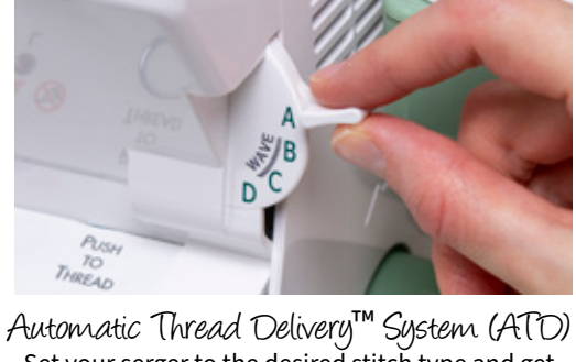
Set your serger to the desired stitch type and get started! This system delivers a balanced stitch on any fabric and using any type of thread.