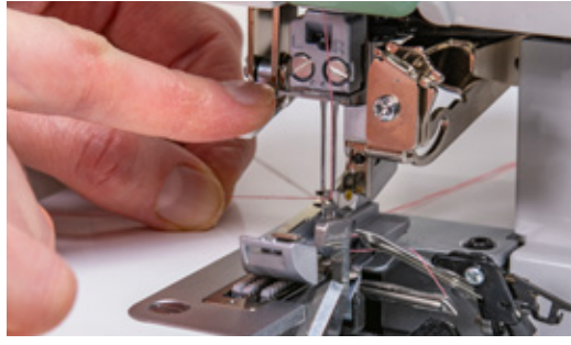
Needle Threading System The needle threader holds the thread in place for quick and easy threading with just the touch of a lever.