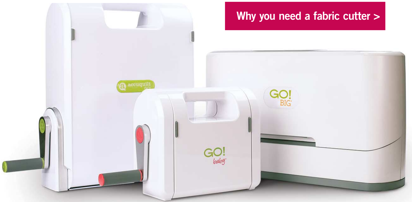
GO! FABRIC CUTTER