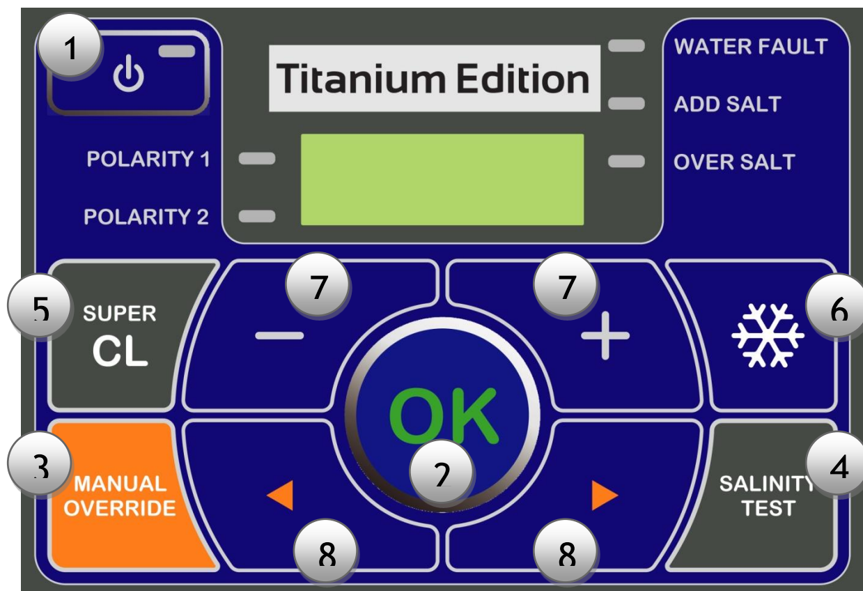
9.1.1 Figure 6 - Keypad Controls