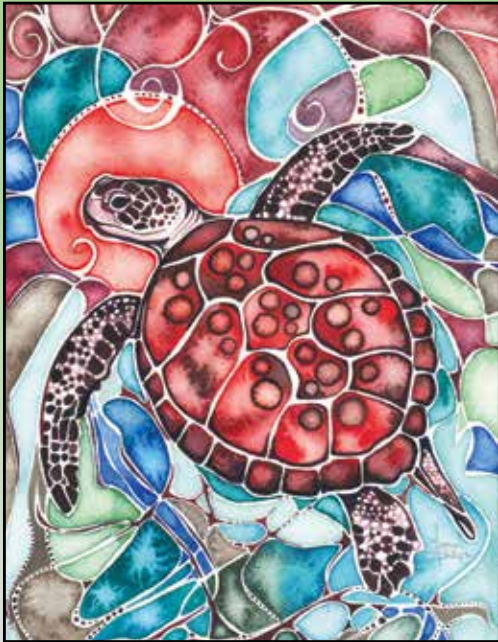
Sea Turtle