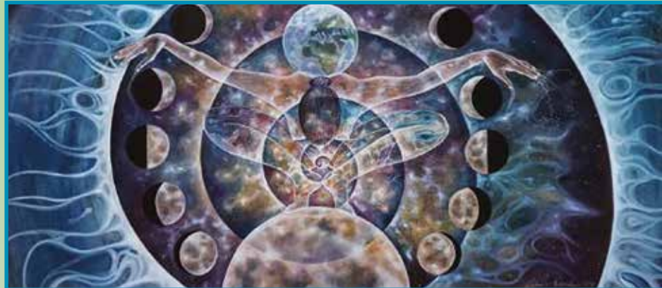
Female Strength © Helena Arturalezca 2016