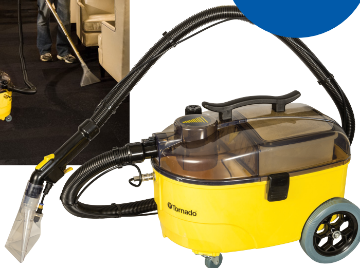
Marathon 350 Carpet Spotter