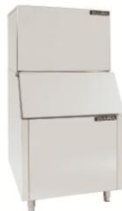
DUURA Machine Shown on Bin

Small to medium capacity ice storage bins for use with all major commercial icemakers. Storage capacities from approximately 299 to 431 kg (660 to 950 lbs). All models come standard with stainless steel exterior. All bins include stainless steel tops custom-cut to accommodate any ice machine.