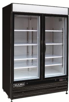
DGMB48R (Color: Black)

Glass Door merchandisers are designed for durability and visual appeal in promoting your product. Glass door merchandisers are energy efficient and effective at keeping product at exactly the right temperature. This keeps food fresher for longer. The simple-to-use but precise digital controls allows for accuracy in temperature and flexible use of the unit.