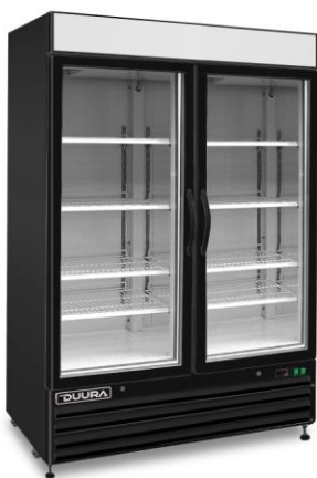
DGMB48F (Color: Black)

Glass Door merchandisers are designed for durability and visual appeal in promoting your product. Glass door merchandisers are energy efficient and effective at keeping product at exactly the right temperature. This keeps food fresher for longer. The simple-to-use but precise digital controls allows for accuracy in temperature and flexible use of the unit.