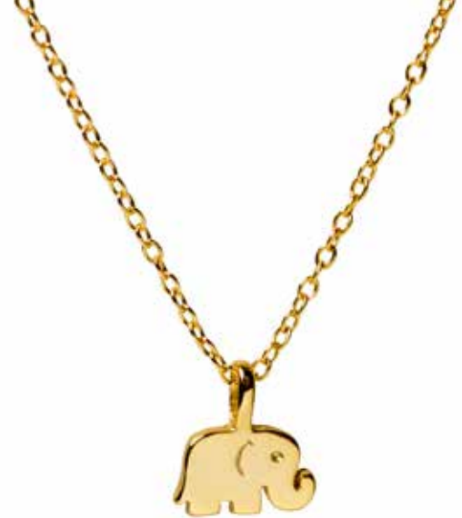
Live large. Tiny Christy Elephant necklace $49 available in sterling silver, 14K gold or 14K rose gold dipped.