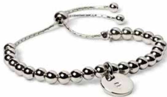
Falon Friendship Ball bracelets in gold and silver $151