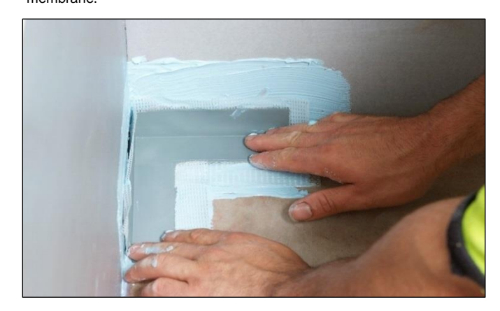
Installing Elastoproof Prefabricated Corners

Measure and cut Elastoproof Joint Band for all wall/floor junction areas. Apply first coat of Gripset 38 membrane to extending 150mm up walls and on to floors, and embed Elastoproof Joint Band into wet bed of liquid membrane, ensuring fabric edges are fully wet out and no air bubbles exist behind the fabric. Rear rubber section of Elastoproof Joint Band is not bonded to substrates. At sections where Joint Band is to be joined, a minimum 50mm overlap is required. Elastoproof Prefabricated Corners are available for both internal (90°) and external (270°) junctions, enabling Joint Band to overlap and avoid joint at critical areas. If Prefabricated corners are not used, Elastoproof Joint Band is to have bottom leg cut and folded; ensuring fabric is completely bonded with Gripset 38 membrane.