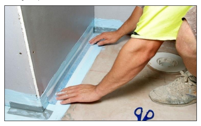
Installing Elastoproof B50 Bond Breaker Joint Band