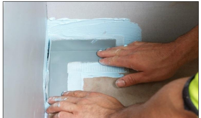
Installing Elastoproof Prefabricated Corners

Measure and cut Elastoproof Joint Band for all wall/floor junction areas. Apply first coat of Gripset C-1P membrane to extending 150mm up walls and on to floors, and embed Elastoproof Joint Band into wet bed of liquid membrane, ensuring fabric edges are fully wet out and no air bubbles exist behind the fabric. Rear rubber section of Elastoproof Joint Band is not bonded to substrates. At sections where Joint Band is to be joined, a minimum 50mm overlap is required. Elastoproof Prefabricated Corners are available for both internal (90°) and external (270°) junctions, enabling Joint Band to overlap and avoid joint at critical areas. If Prefabricated corners are not used, Elastoproof Joint Band is to have bottom leg cut and folded; ensuring fabric is completely bonded with Gripset C-1P membrane.