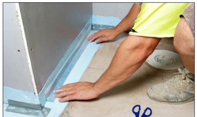
Installing Elastoproof B50 Bond Breaker Joint Band