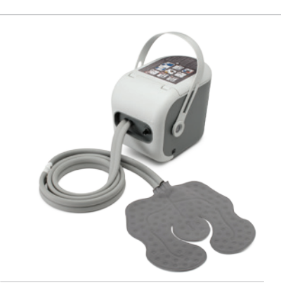
Cold Rush<sup>®</sup> Convenient, whisper quiet and easyto-use, Cold Rush delivers hours of cold therapy when and where you need it.

Rebound<sup>®</sup> PCL Designed to optimize rehab by reducing load on the PCL by applying a dynamic, physiologically-correct force during non-surgical or post-surgical treatment.