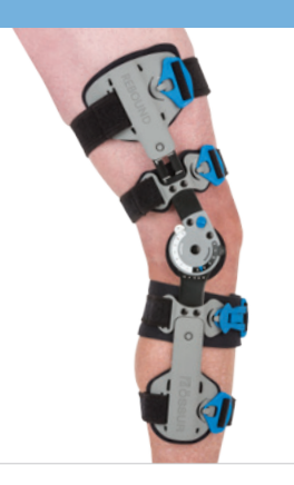
Rebound<sup>®</sup> Post-Op Knee Controlled range-of-motion in a lightweight, quick-fitting design.