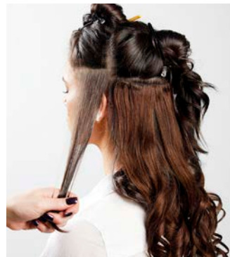
11. Apply to both sides