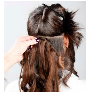
8. Handy Hint: Always clip the middle snap clip first, this will centre and keep your piece level