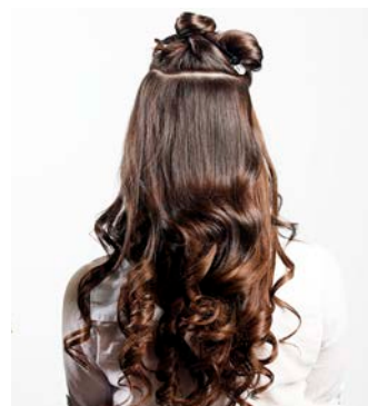
14. Finish back view, luscious, long and full of body!