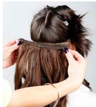
7. Select the 8" 3 clip piece and insert