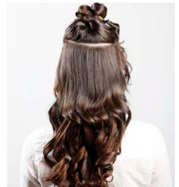
12. Prepare the 4th row