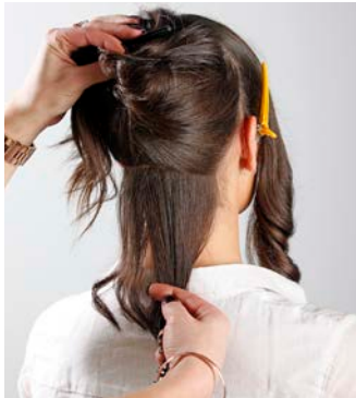
1. Section the hair on the Occipital Bone to create the first row