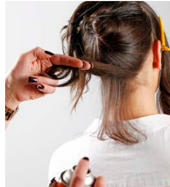
2. Handy Hint: Spray a little hairspray to add grip to your hair