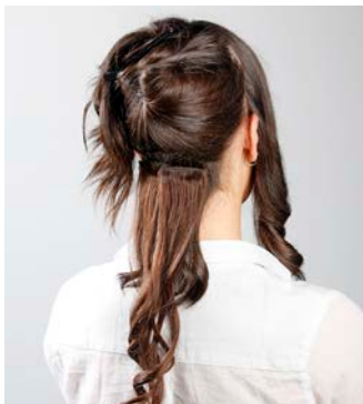
5. Position the two 2" pieces side-by-side in the first row