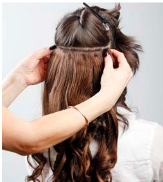
9. Prepare and clip in the 3rd row with a 5 clip 10" piece