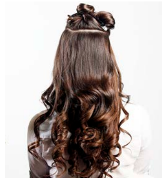
14. Prepare the final row 5 and clip in the 3 clip 8" piece