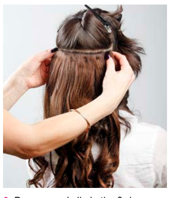
9. Prepare and clip in the 3rd row with a 5 clip 10" piece