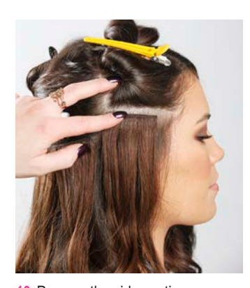
10. Prepare the side sections. Clip in 1 clip 2" piece