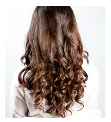
15. Finish back view, luscious, long and full of body!