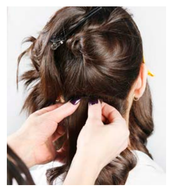
4. Place the first piece and snap close the clip