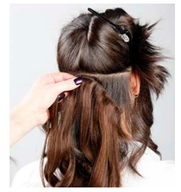
8. Handy Hint: Always clip the middle snap clip first, this will centre and keep your piece level