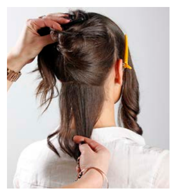
1. Section the hair on the Occipital Bone to create the first row