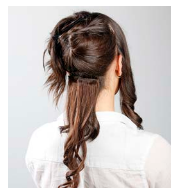
5. Position the two 2" pieces side-by-side in the first row