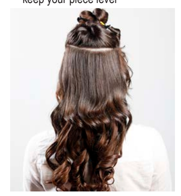
12. Prepare the 4th row