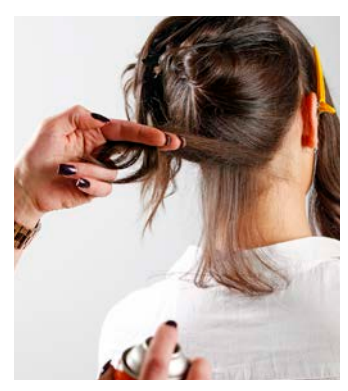
2. Handy Hint: Spray a little hairspray to add grip to your hair