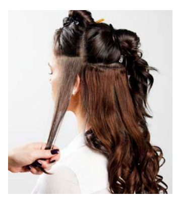
11. Apply to both sides