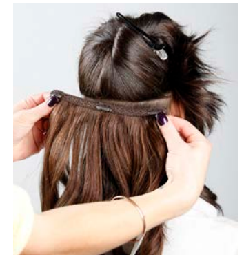
7. Select the 8" 3 clip piece and insert