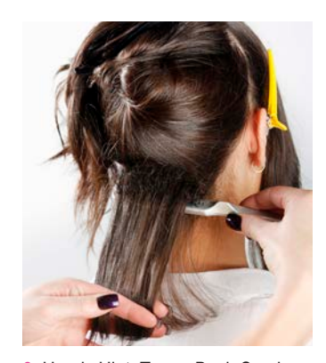
3. Handy Hint: Tease-Back Comb your hair for extra strong grip of the snap clips