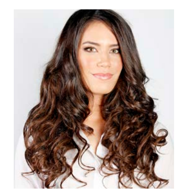
16. Finish front view – Spectacular!