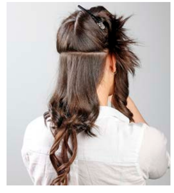
6. Section the second row