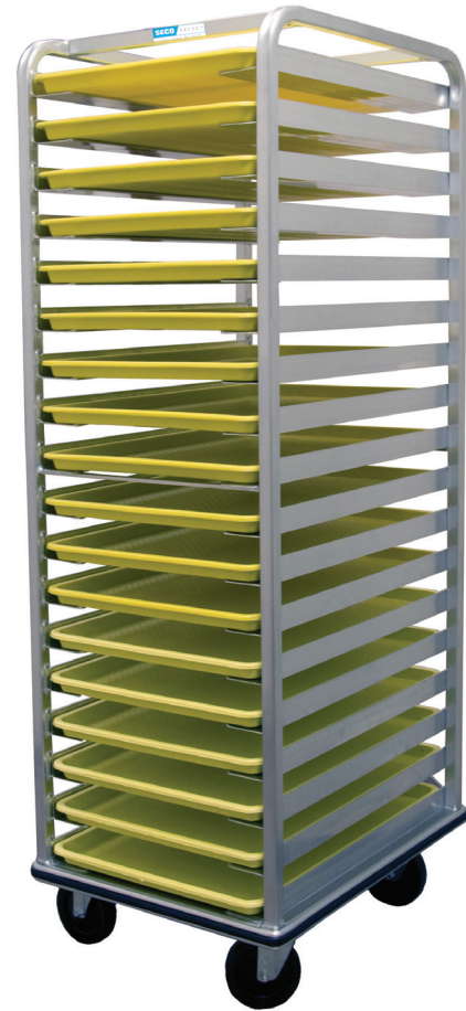
ORV-3-1818-X shown with optional perimeter bumper