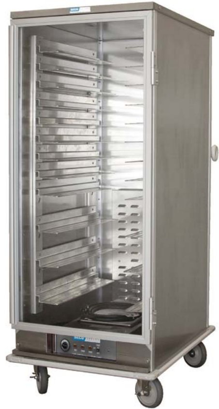
VCHI-66-RFMG shown with perimeter bumper