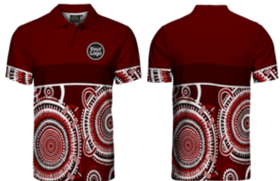
Colour Design 3b