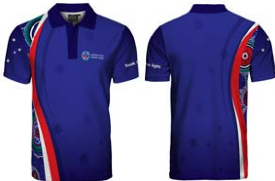
Subtle Indigenous Design incorporated into the School Uniform