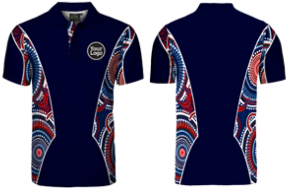
Colour Design 1a