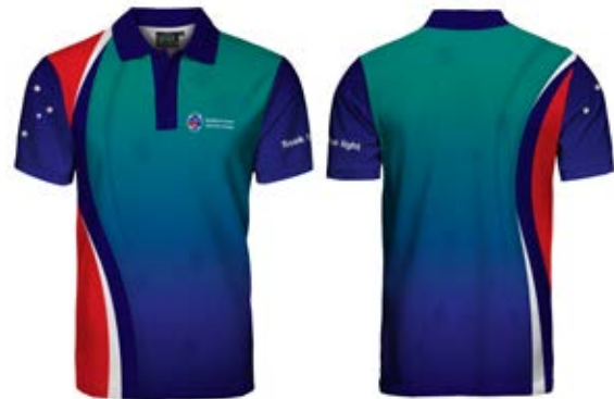
No Indigenous Design incorporated into the School Uniform