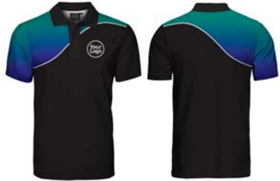
Layout Design 2