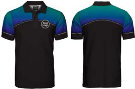
Layout Design 1