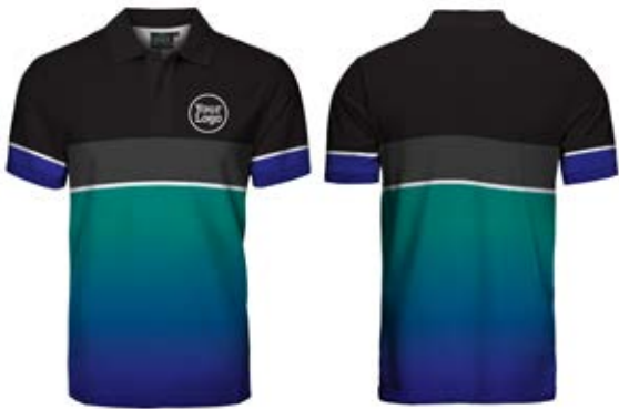
Layout Design 3