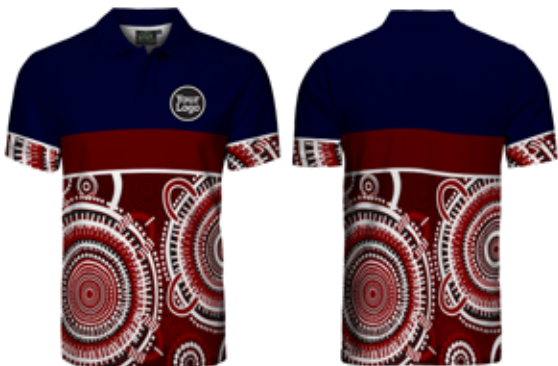
Colour Design 3a