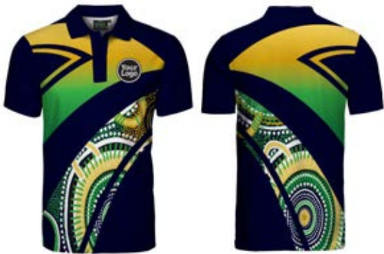
Colour Design 2a