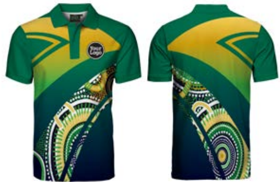
Colour Design 2b