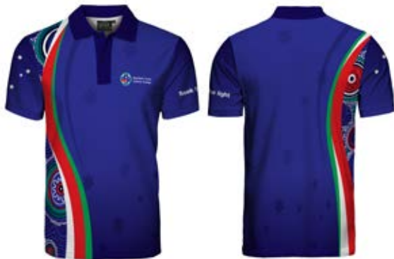
All house colours represented + Indigenous Design incorporated into the School Uniform