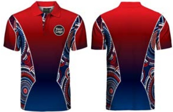
Colour Design 1b