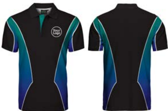
Layout Design 5