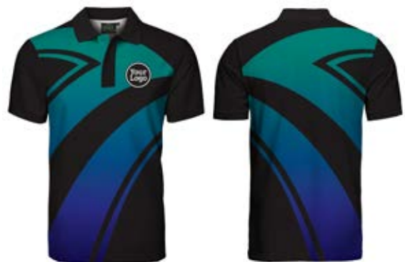
Layout Design 6