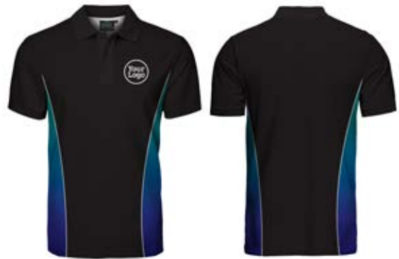
Layout Design 4