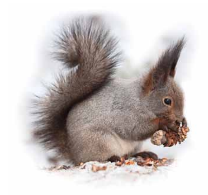
THE ENVIRONMENTAL CHOICE. That's what you make when you burn wood in a Broseley stove - good for the planet as well as great for the home.