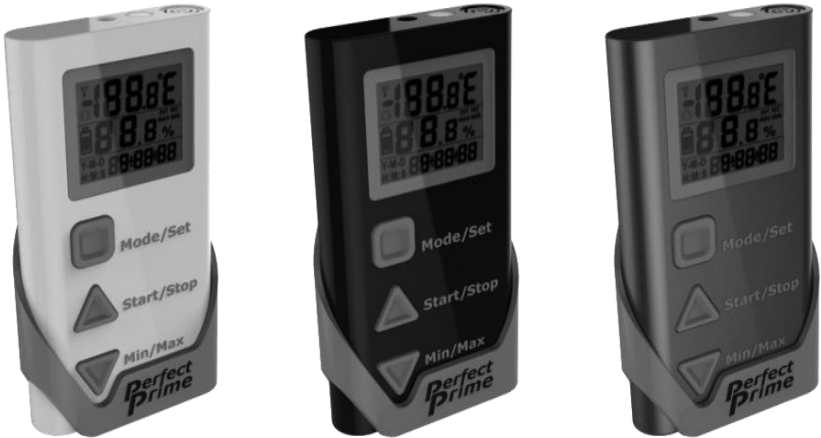
Picture of products for reference only