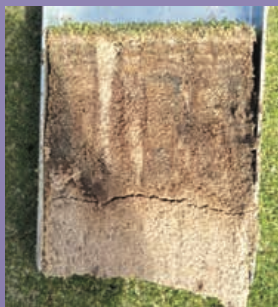
FIG 2. After Soil Prima, applications on same green.

The recycling of organic matter creates a more friable layer which in turn allows water to pass through more easily and aids in flushing sulphur accumulation, the root cause of 'black layer'.