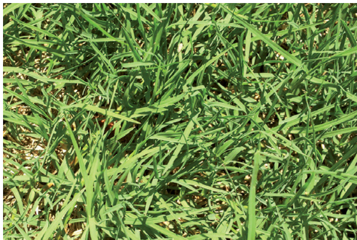
Couch Grass ( Cynodon dactylon )

Apply FUSILADE FORTE to young, actively-growing weeds. For best results, spray between the three-leaf weed stage and early tillering (three tillers). Use higher application rates once tillering occurs. Spray before late tillering if a complete kill is desired. Do not treat weeds under poor growth or dormant conditions.