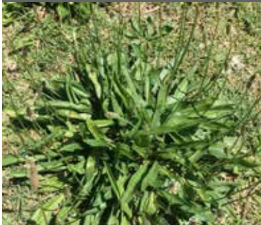
Plantain – Plantago lanceolata