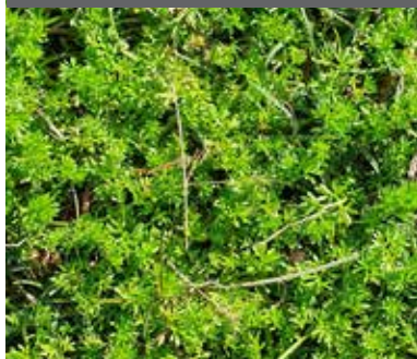
Bindii – Soliva sessillis