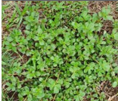
Pigweed – Portulaca oleracea