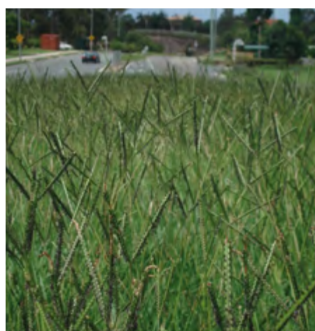
Bahia Grass Seedheads

MONUMENT LIQUID can be used as a post-emergent herbicide on the following warm season turf species: