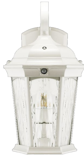
Integrated LED Fixture

*Note: Design, features and specifications subject to change without notice. Some features may not be available on all models. For more information please visit: www.eurilighting.com or call 1-888-743-5766