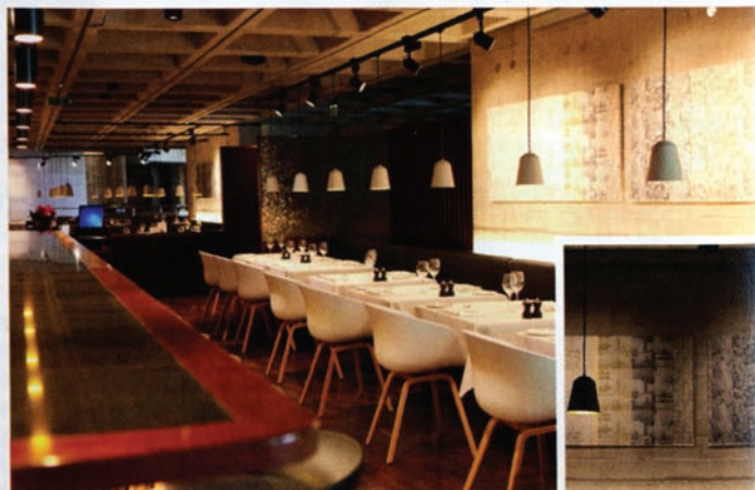
MAIN PICTURE The restaurant embraces Denys Lasdun's brutalist concrete grid ceiling. INSET Pared-back lighting complements the textured Ismini Samanidou wall hangings

FOOD AND DRINK An espresso martini will perk you up for even the longest Pinter. Starters feature steak tartare, smoked octopus or a beetroot salad. Comforting mains include an artichoke risotto, pan-fried cod and chips and short rib and ox cheek bourguignon. For the sweet-toothed, there's a flavour to fit any taste with strawberry and raspberry fraiser, orange and milk chocolate mousse or a warm caramelised apple with shortbread.