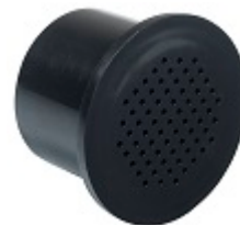
Active charcoal filter - FILTER1 It's recommended to change it every years.

**Thanks to the Vinotag® application, benefit from a digital register of your wine cellar and be alerted of the peak dates of your wines. In partnership with Vivino, scan your bottle to access its pre-filled wine sheet.