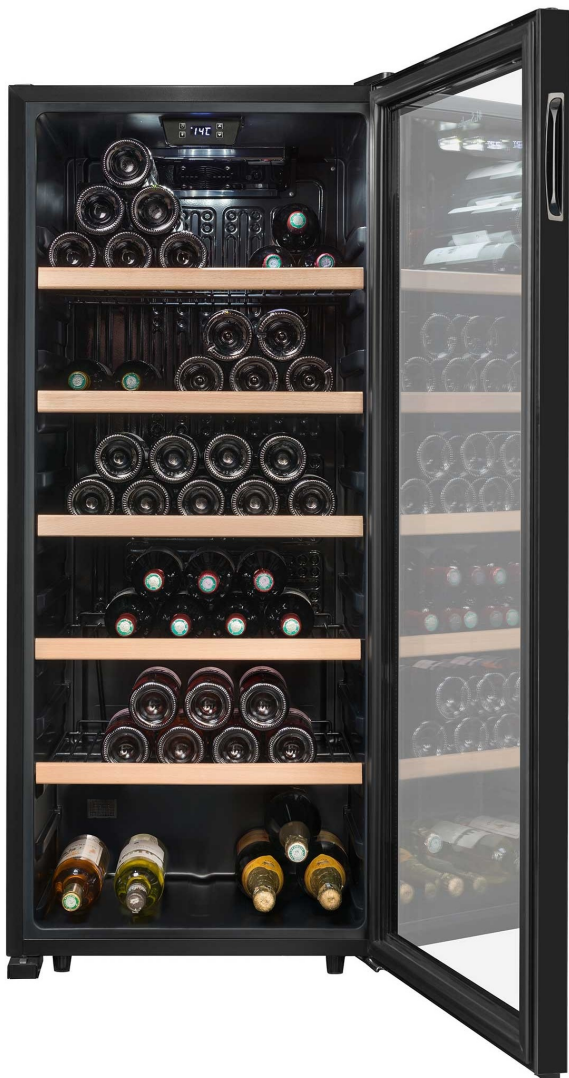
121 Bordeaux 75cl bottles capacity with 3 shelves 105 Bordeaux 75cl bottles capacity with 5 shelves