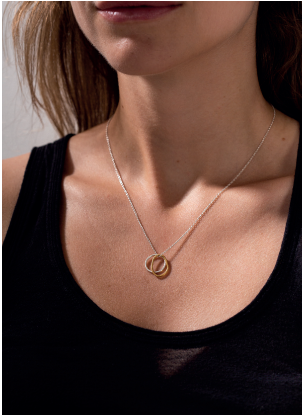
Above: Model wears 2313 - 18" Verona Necklace. Middle: 2259 - 18" Silver Oslo Necklace with 2263 - 16" Silver Paperclip Chain. Right top: 2314 - 20" Silver Hammered Hoop Necklace. Right bottom: 2326 - 16" Smoke Glass Teardrop Necklace.

We've added shorter choker necklaces and longer length chains. Something for everyone and perfect for layering.