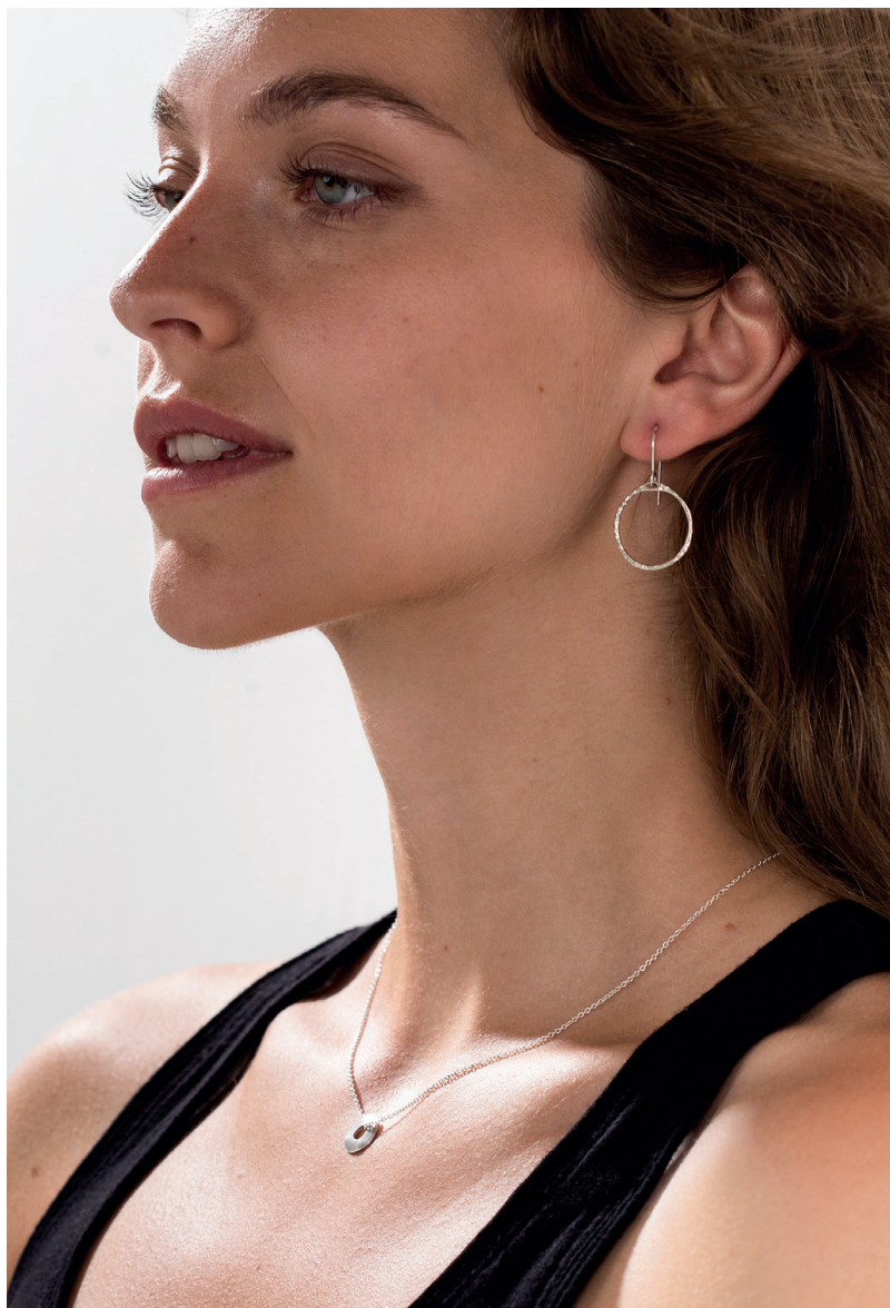
Made to be loved. Left: 2340 - Gold Tolvan Satellite Necklace with 2304 - Gold Tolvan Large Hoop Earrings and 2308 - Gold Milan Earrings. Above: Model wears 2309 - Silver Ancey Earrings and 2316 - Silver Tolvan Shine Necklace.