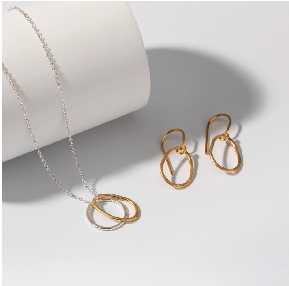
New Willow and Verona collections. Left: Model wears 2305 - Gold Tiny Brushed Star Studs and 2318 - Gold Willow Necklace. Above: 2313 - Verona Necklace and 2312 Verona Earrings.

We make modern jewellery - beautiful & effortless. We use the finest materials and package it perfectly. Live life today, tomorrow & every day.