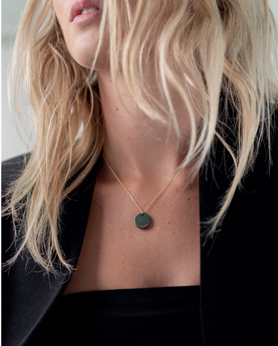
Above: Model wears 2166 - Porcelain Forest Mist Necklace. Right: 2301 - Porcelain Mini Forest Necklace, 2295 - Porcelain Forest Deco Earrings, 2254 - Gold Florence Studs.