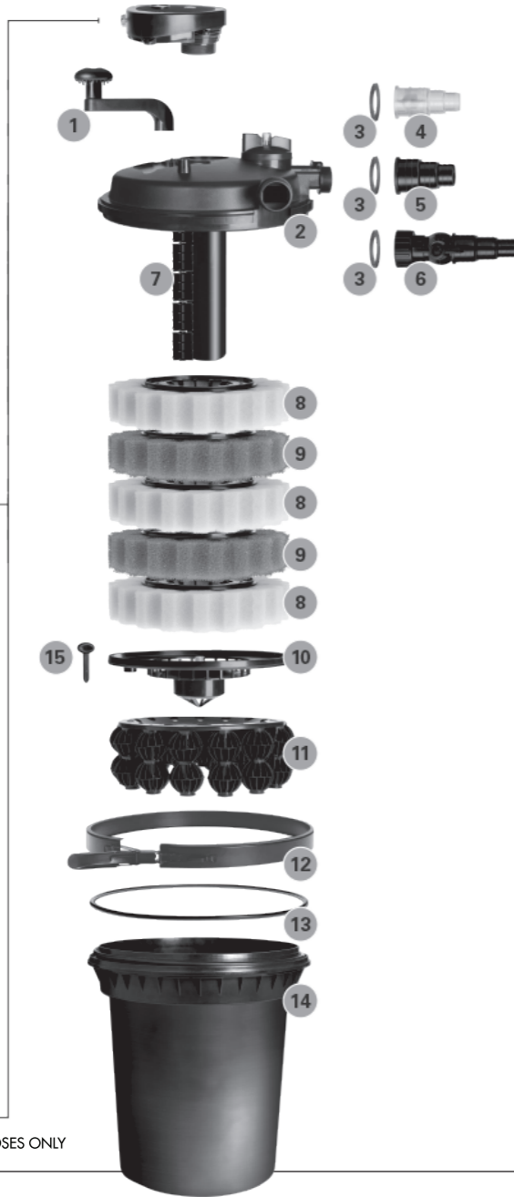
PF2400 IMAGE SHOWN FOR ILLUSTRATION PURPOSES ONLY