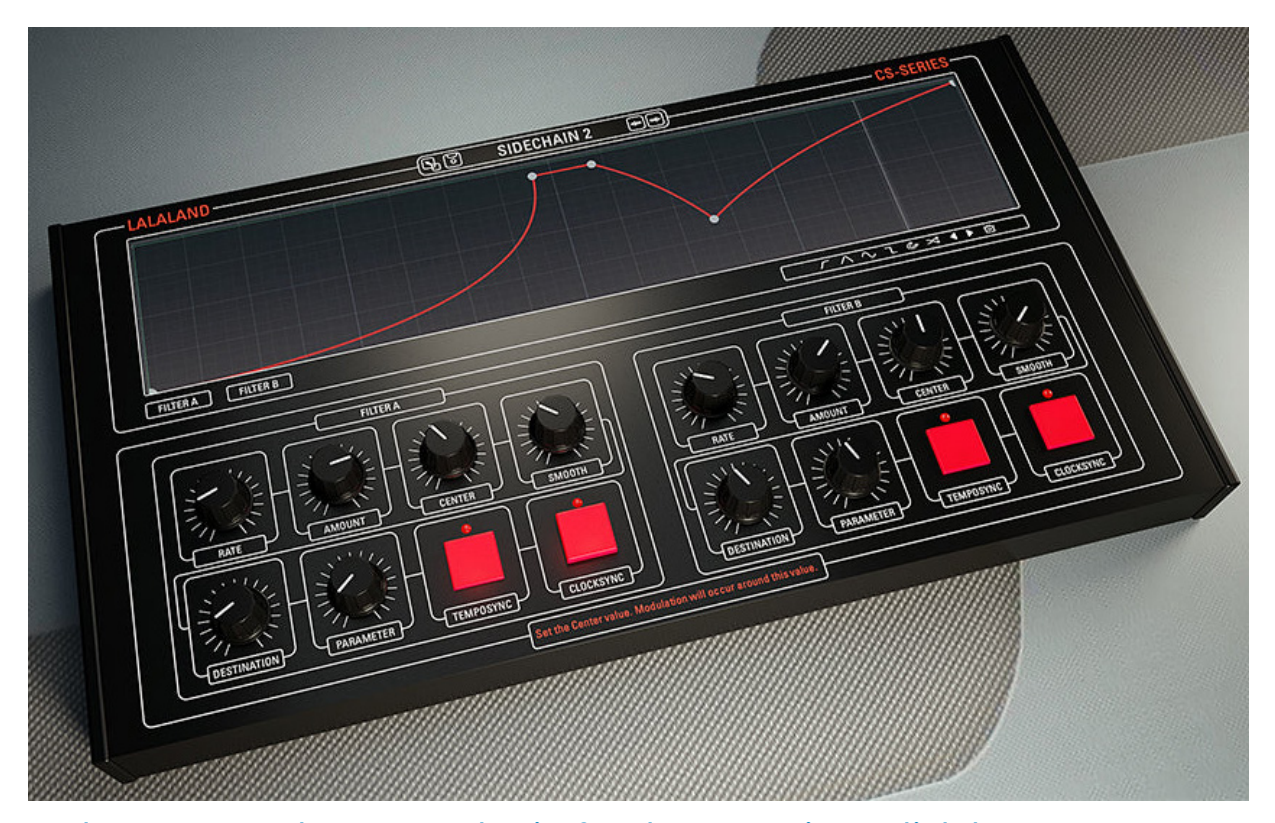
To learn more about our plugin for the CS series - click here