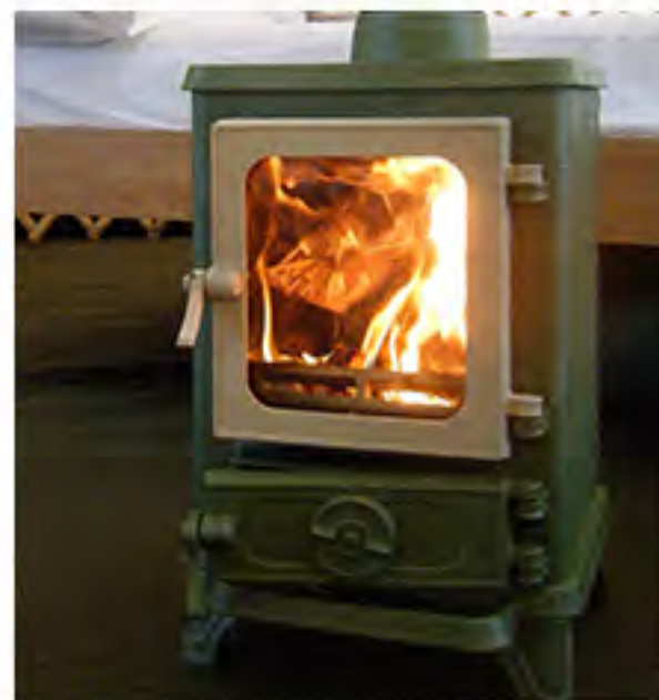
Tree Houses / Yurts

Contact your local dealer or visit our online shop for a full range of spares, stove care products and bespoke flue kits.