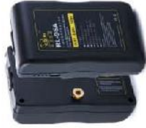
RL-95A Big 95Wh