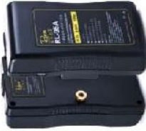
RL-95A Small 95Wh