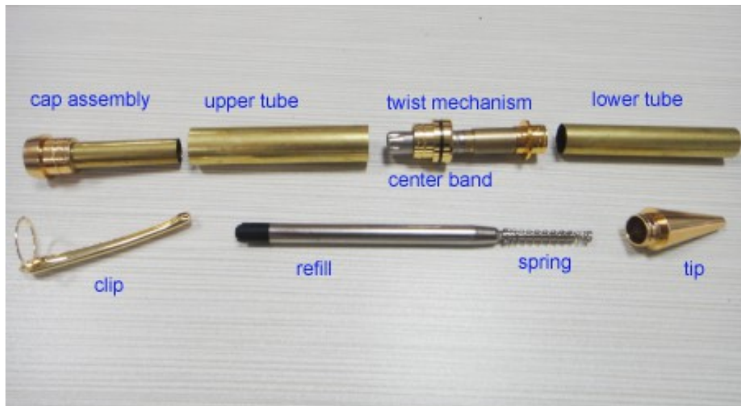
DIAGRAM A -- Assembly