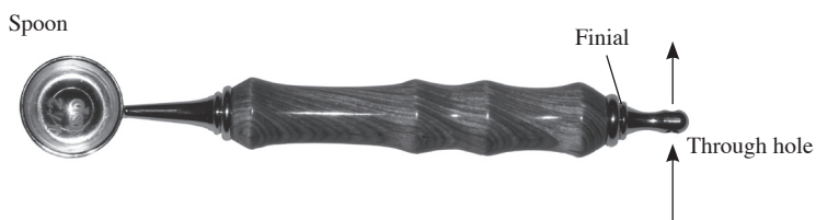
Diagram D / Bushings #PKMSPNBU