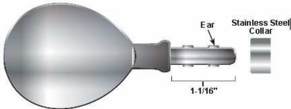
Diagram A - Parts and Assembly