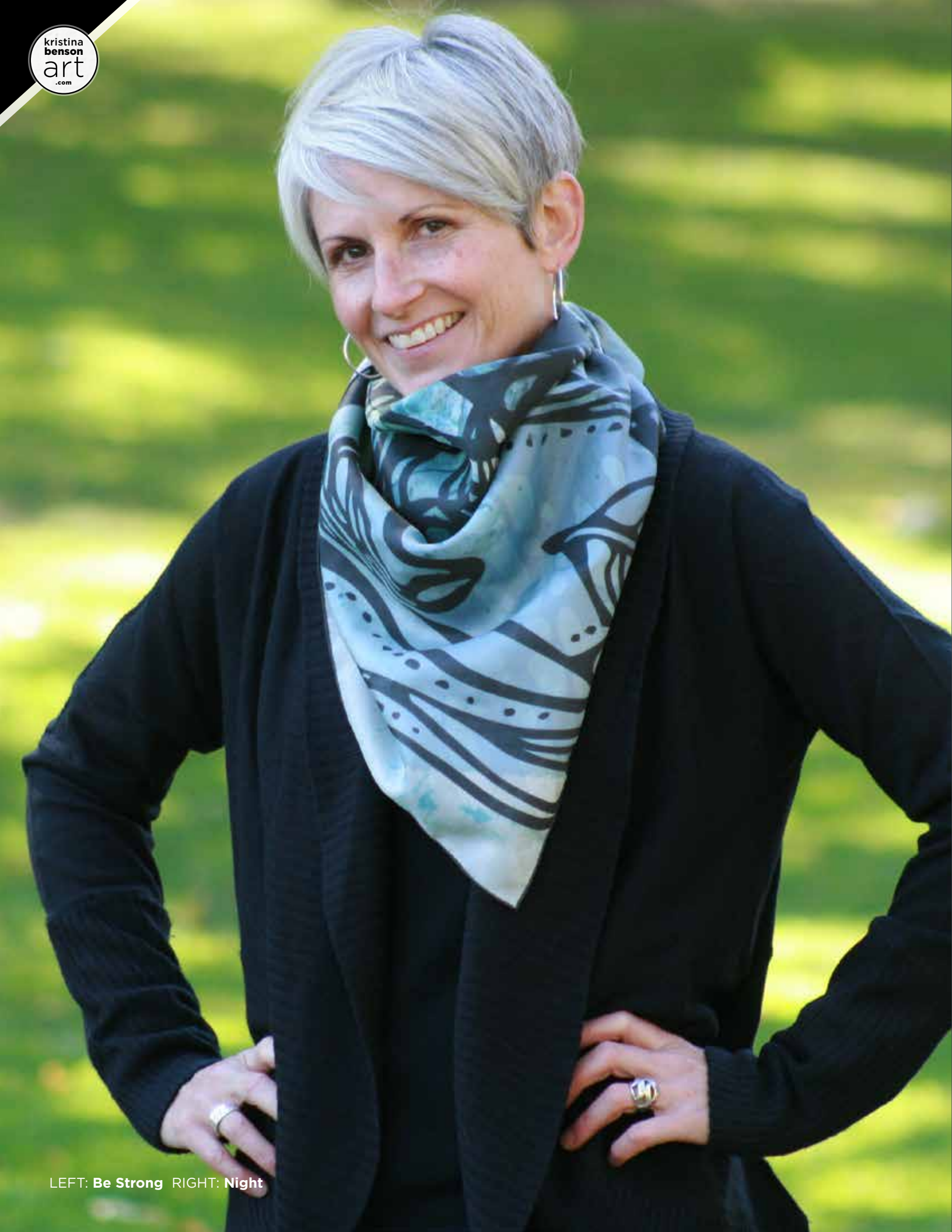
LEFT: Be Strong RIGHT: Night