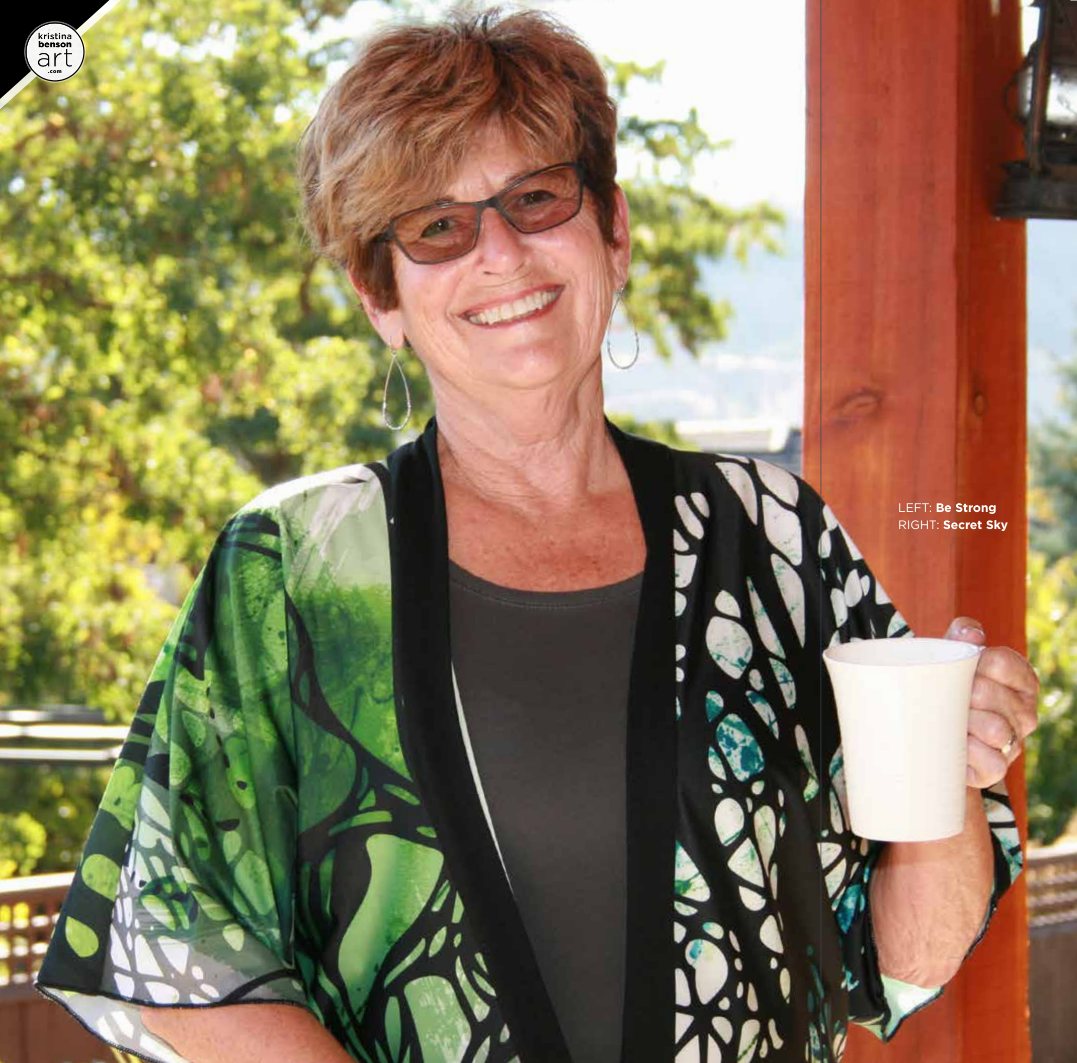
LEFT: Be Strong RIGHT: Secret Sky