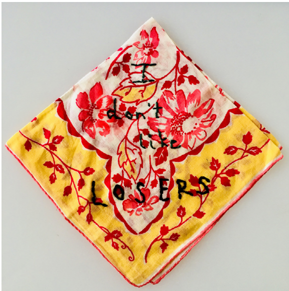
@mimisfabulousjunk , Lonesome Loser #TinyPricks62 , thread, heroic statements, 2018.

Here Are Two Examples By Guest Participants: