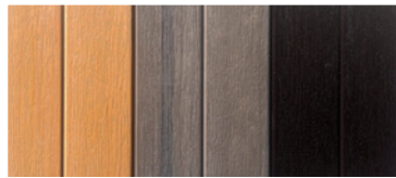
Teak Gray Mocha

Excel-X™ This ecologically friendly, high-impact styrene looks and feels like real, natural wood. It won't weather or stain and is virtually maintenance free.