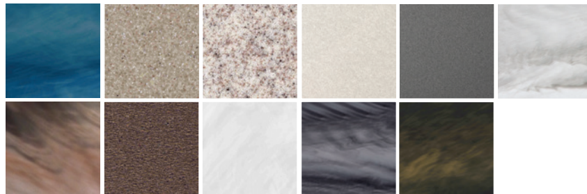
Left to right: Pacific Rim, Desert, Sahara, Gypsum, Winter Solstice, Glacier Mountain, Tuscan Sun, Latte, Silver Marble, Storm Clouds and Midnight Canyon

Your Vita Spa is available in eleven vibrant colors to complement the beauty of its design.