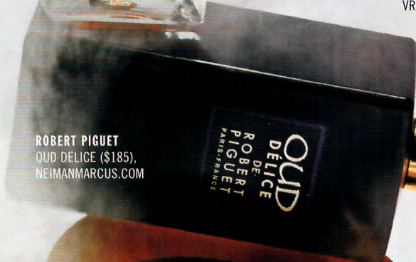
ROBERT PIGUET OUD DELICE ($185), NEIMANMARCUS.COM