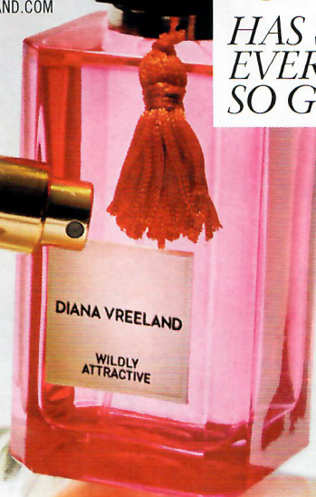
DIANA VREELAND WILDLY ATTRACTIVE ($250), DIANA VREELAND.COM