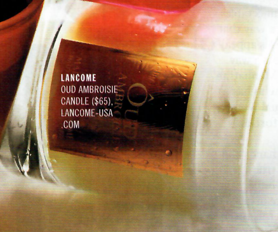
LANCME OUD AMBROISIE CANDLE ($65), LANCME-USA.COM