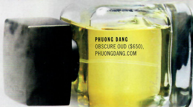
PHUONG DANG OBSCURE OUD ($650), PHUONGDANG.COM