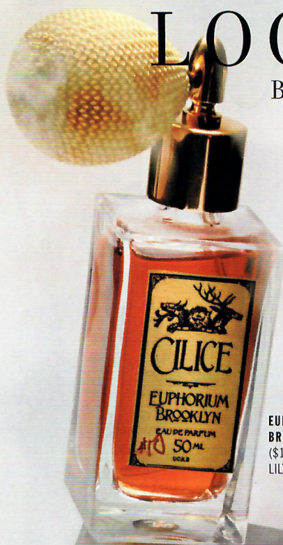
EUPHORIUM BROOKLYN CILICE ($180), TWISTED LILY.COM