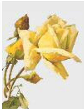
S-I704 YEL ROSE