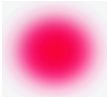
col. 001 Rose

Remarks For any other inquiries please contact Manufacturer