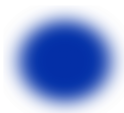
col. 002 Blues

No liability is accepted for data which are faulty in content or incomplete.