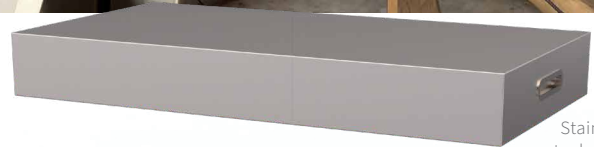
Stainless steel cover