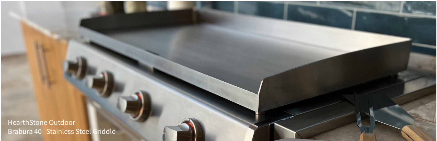
HearthStone Outdoor Brabura 40 Stainless Steel Griddle