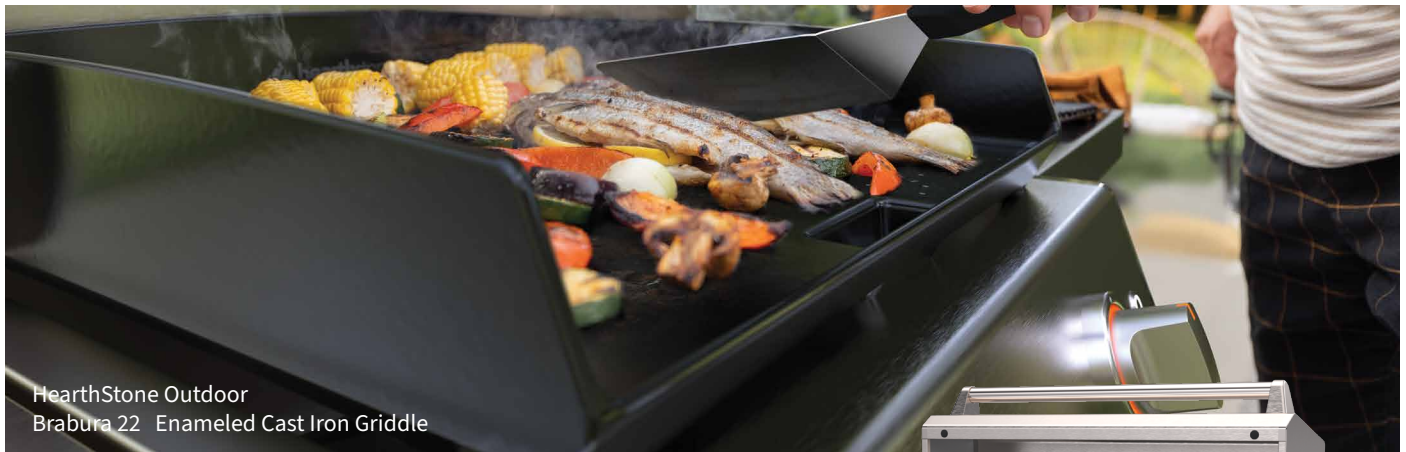
HearthStone Outdoor Brabura 22 Enameled Cast Iron Griddle