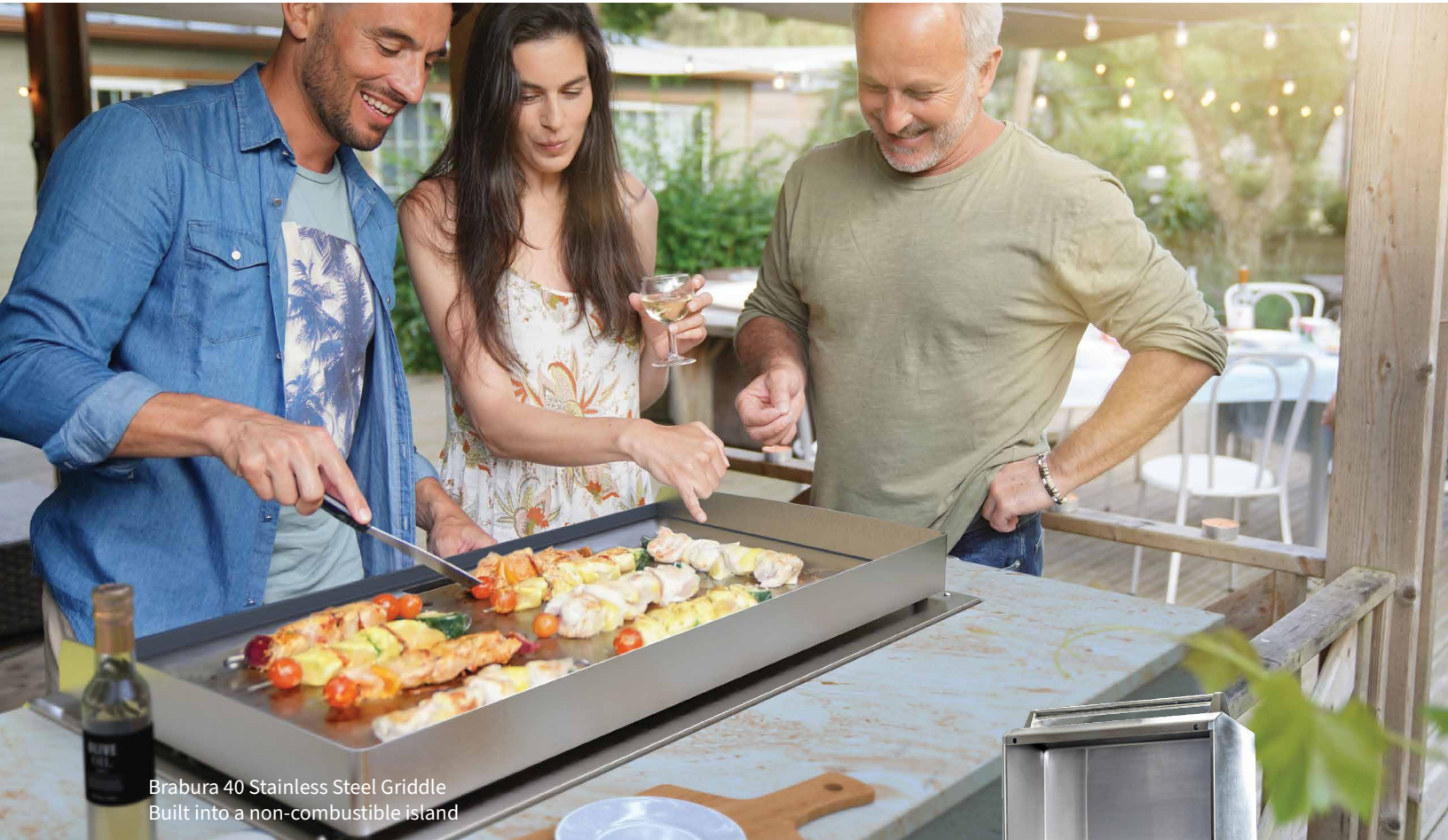
Brabura 40 Stainless Steel Griddle Built into a non-combustible island