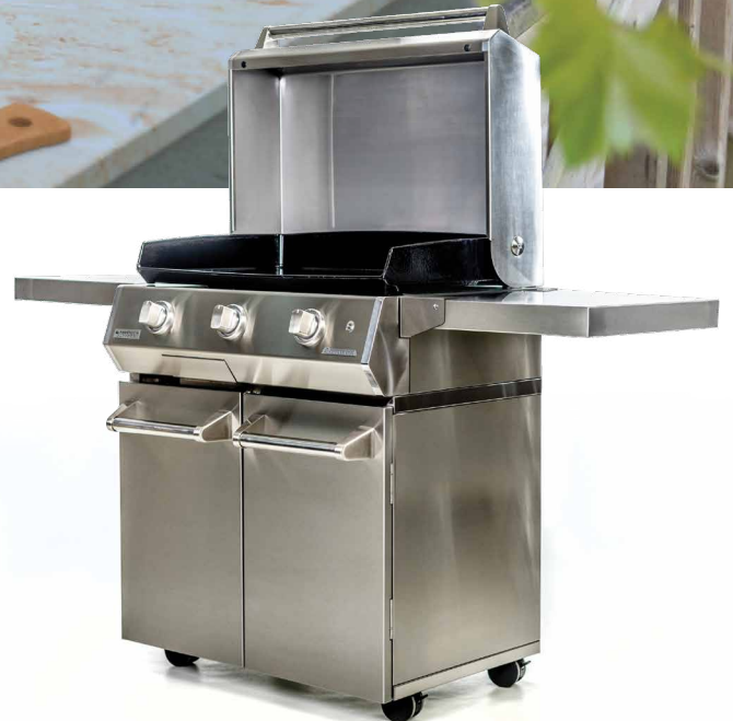
Brabura 32 Enameled Cast Iron Griddle with Rolling Base