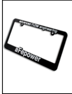
aFe License Plate Frame