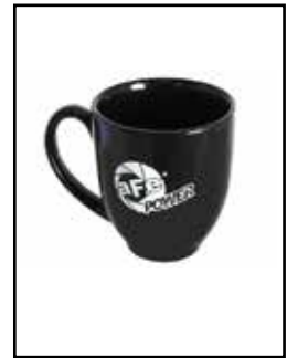
aFe power Mug