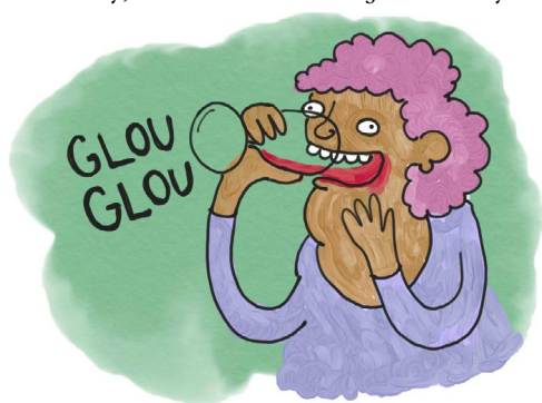
Illustration by Zachary Carlsen for Sprudge Wine

ourselves though. It's not like glou glou wines are sweeping the nation. Do you know how many of the top 20 highest grossing restaurants in the US are in cities with the highest concentration of natural wine establishments (New York, San Francisco, or Los Angeles)? One. Are people still buying oceans of The Prisoner and Caymus? Hell yes. But volume and historical popularity are never the arbiters of change. Just as the country looks to culinary destinations like our fair city to see what's new, exciting, and worthy of emulating elsewhere in the world of restaurants, we too look to these same destinations for a heads up on what's