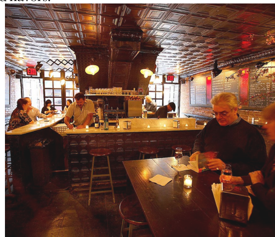
The Ten Bells New York City, Time Out 2010

Yet, while this funkiness can be polarizing, it also becomes emblematic of a shifting paradigm: one that embraces the ever-changing nature of wine and the world around us. It represents the vintners adapting to climate change, the collective palate moving away from over-processed foods, and a growing fascination with fermented flavors.