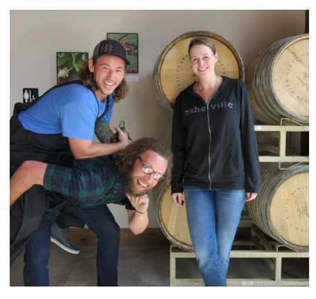
The team at Pleb Urban Winery

physical intervention and not as dependent on chemicals. This is the continuity I look for in the wine from the vineyard."