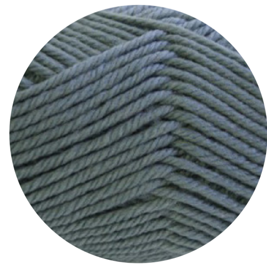
Steele Blue (90)