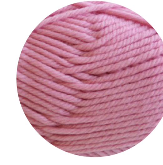
Light Pink (30)