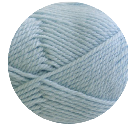
Pale Blue (31)