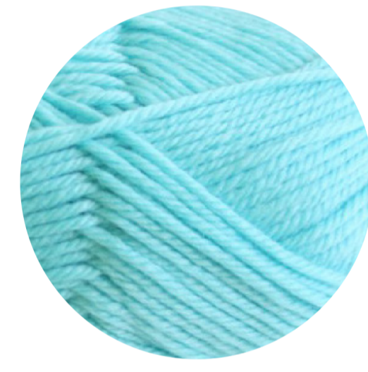
Light Aqua (200)