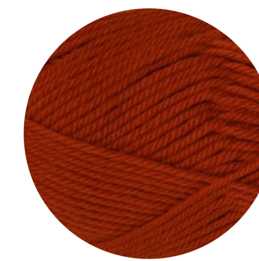
Burnt Orange (14)