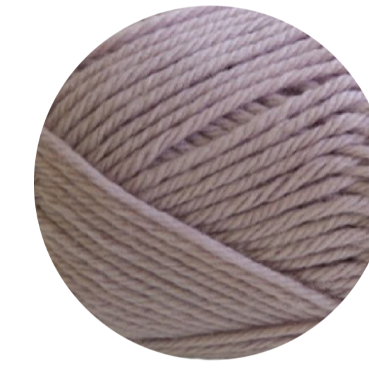
Light Mauve (34)