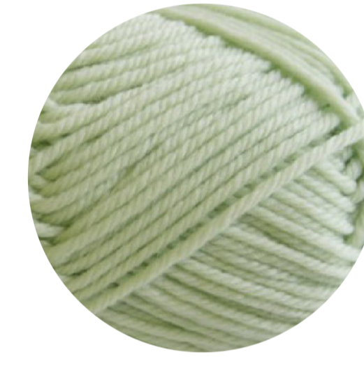
Light Green (33)