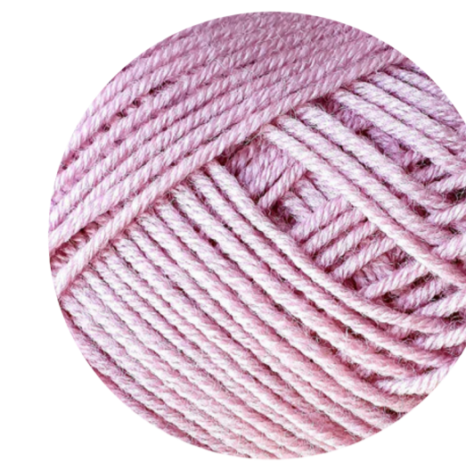
French Rose (46)