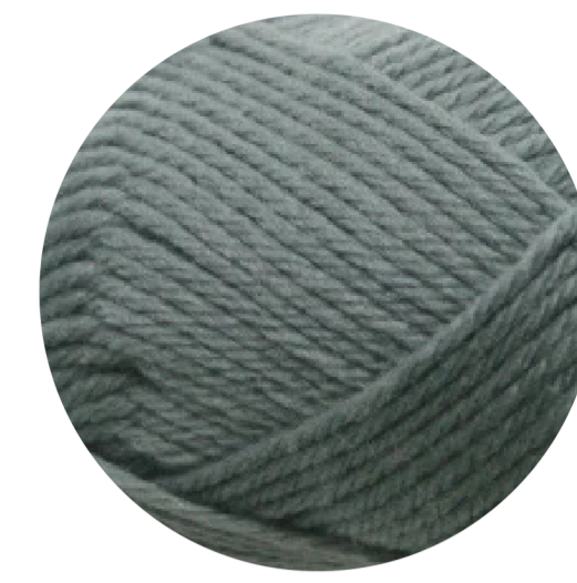
Blue Gum (21)