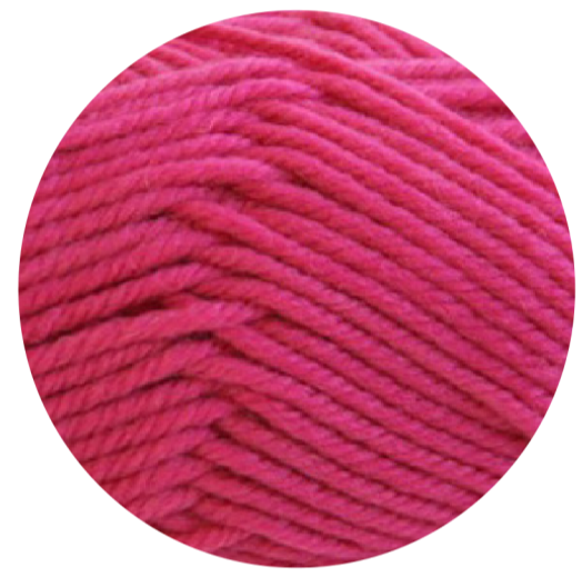
Hot Pink (2)