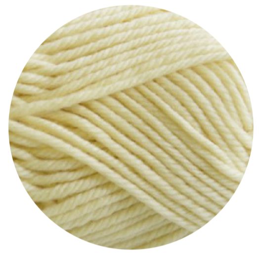
Light Yellow (32)