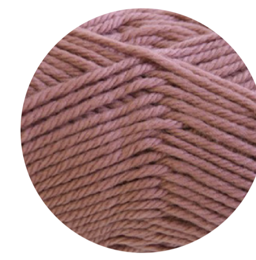
Dusky Rose (92)