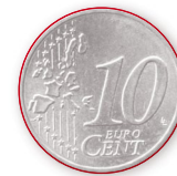
19,75 mm diameter