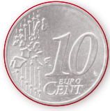
19,75 mm diameter