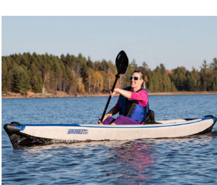
SEA EAGLE RAZORLITE 393RL KAYAK