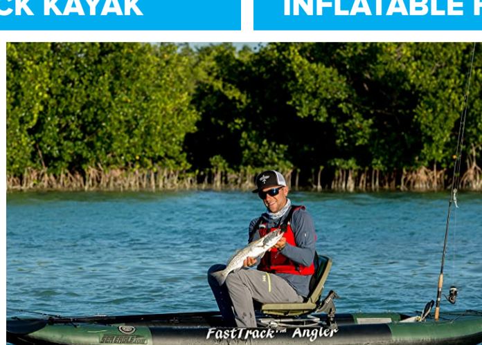
SEA EAGLE 385FTA INFLATABLE FISHING KAYAK