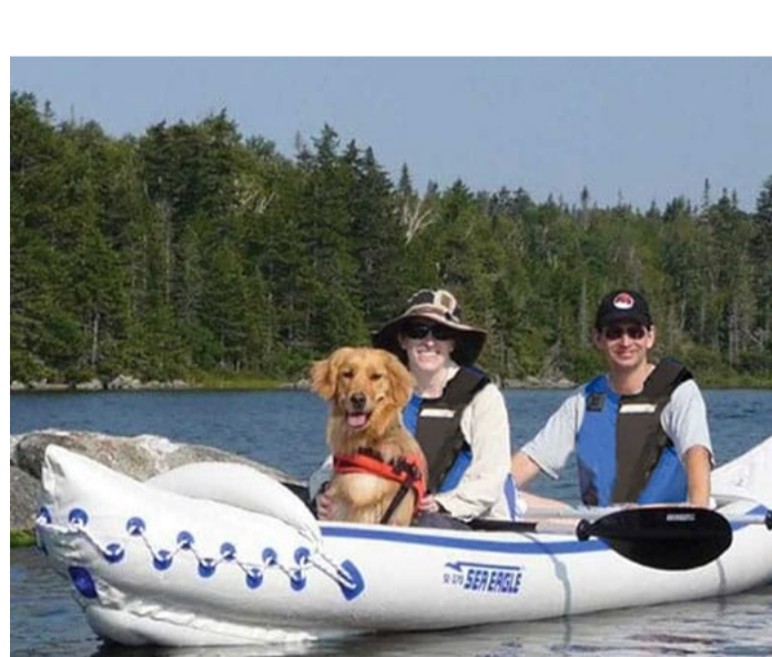
SEA EAGLE SE370 AND SE330 KAYAKS