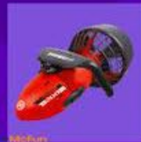
Yamaha RDS200 Sea Scooter